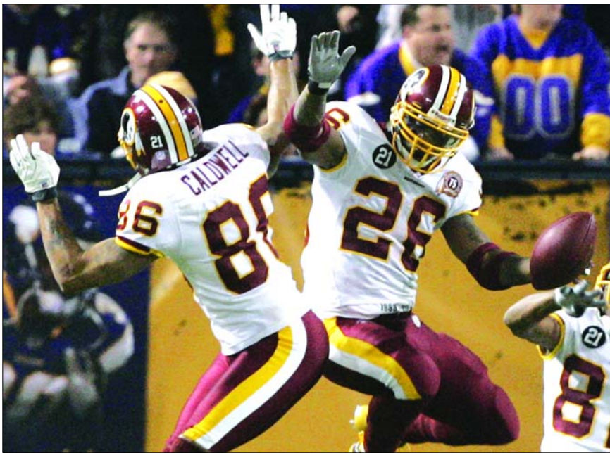
Washington's Reche Caldwell (left) celebrates a 13-yard touchdown run by Clinton Portis in their 32-21 win in Minnesota on Sunday.